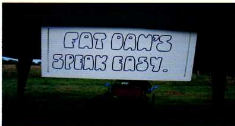
Monday night drinks at West Rudham