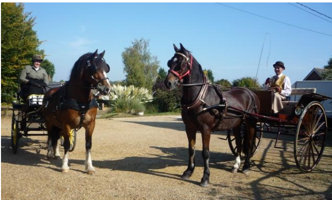
Wally Binder and Hazel Moyes